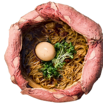
ROAST BEEF RAMEN

Marinated and grilled Tempeh | Peanut Butter Homemade Chili Paste | Shiitake | Bok Choi Spring onions | Nori A D F H O P R