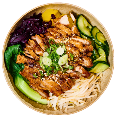
CRISPY TORI DON